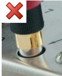
Not fully seated